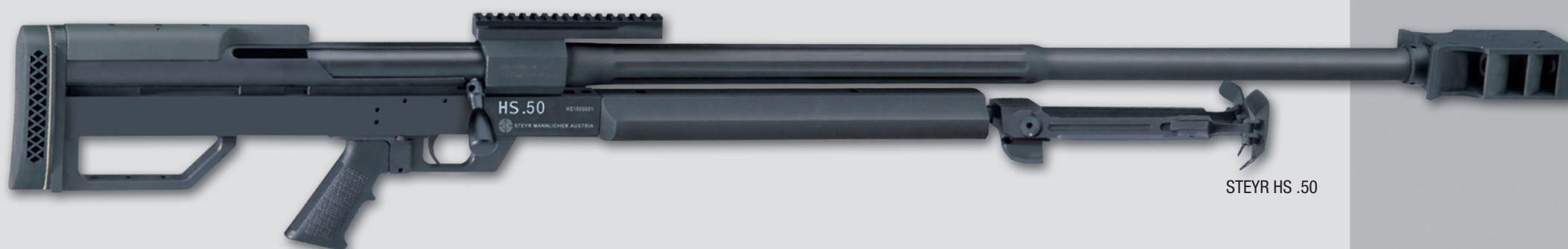
STEYR HS .50