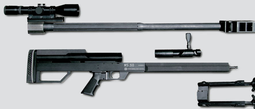
Field stripped STEYR HS .50

All rifles come without optic and mount - Subject to technical changes.